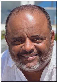
Roland S. Martin

Get ready for an inspiring evening of recognition and remembrance. This year, at our annual Dr. Martin Luther King, Jr. Awards Dinner, we feature keynote speaker Roland Martin. Martin is a nationally syndicated columnist with Creators Syndicate, and was a senior analyst for the “Tom Joyner Morning Show.” He is the author of three books: Listening to the Spirit Within: 50 Perspectives on Faith ; Speak, Brother! A Black Man’s View of America , and The First: President Barack Obama’s Road to the White House as originally reported by Roland S. Martin. Martin is the former executive editor/general manager of the Chicago Defender , the nation’s most historic Black newspaper. He is a 1987 graduate of Jack Yates High School-Magnet School of Communications, and a 1991 graduate of Texas A&M University, where he earned a Bachelor of Science Degree in Journalism. In May 2008, Martin received a Master’s Degree in Christian Communications from Louisiana Baptist University.