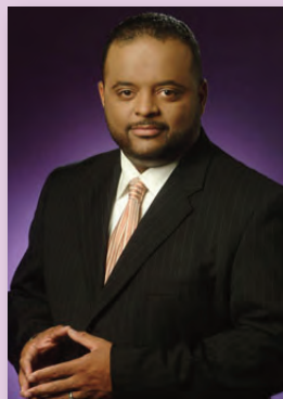
Roland S. Martin

The evening begins with a social hour beginning at 6 p.m. and dinner following at 6:45 p.m. Make your reservations through Minority Involvement Program (MIP) committee members, faculty representatives or CEA. This event is open to the public. Tickets are $25.