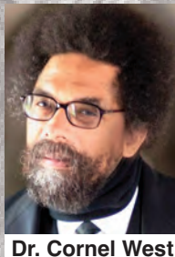
Dr. Cornel West

Tickets are $30 per person; tables of eight are $240. Nominations for this year’s Helen Jenkins Davis and Dr. Martin Luther King, Jr. Humanitarian awards are due Friday, Nov. 22.